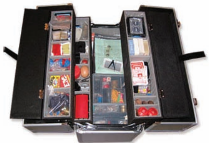
My magic arsenal as it stands today